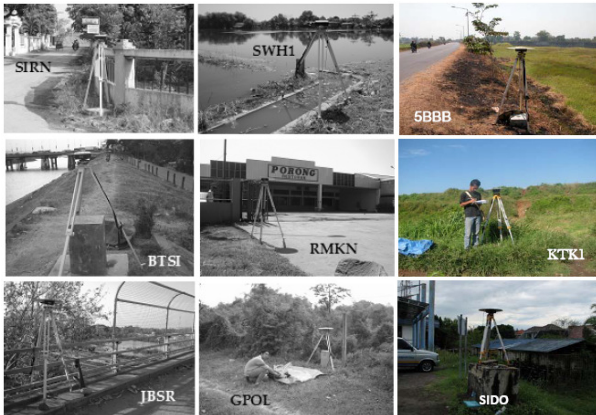
Figure 2 Some documentation of GPS survey in the field using dual-frequency geodetic-type receivers, with observation session lengths of about 5-10 hours.

GPS observations, both in campaign and continuous mode were conducted to study ground displacement phenomenon that following the birth and development of LUSI mud volcano. Thirteen GPS campaigns have been conducted between June 2006 and May 2009. Bellow (figure 2) we can see some documentation of GPS survey in the field.