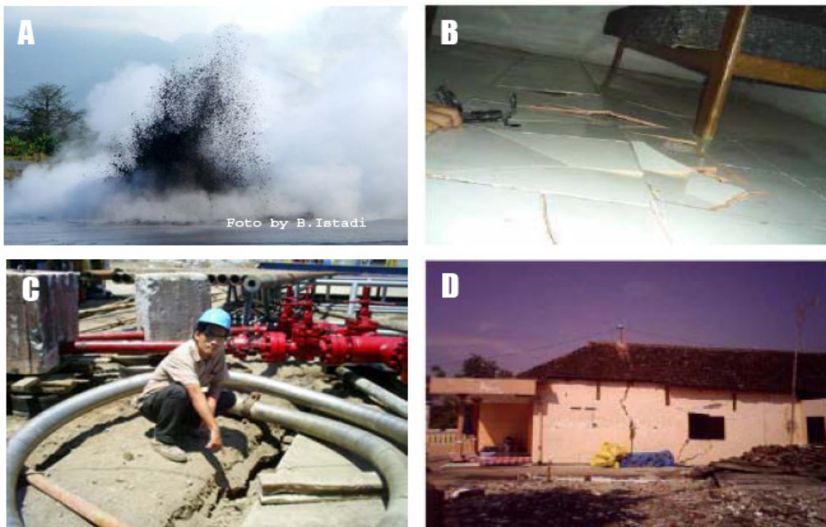
Figure 1 (a) LUSI mud volcano eruption, (b) crack on the floor, (c) cracks on the ground around relief well 1, (d) crack on the house in Sengon Village.

On May 29, 2006 a mud volcano started to form at Porong Sidoarjo East of Java Indonesia. It is further termed as LUSI Mud Volcano (LUSI = Lumpur Sidoarjo ; Lumpur mean mud in Indonesia language). Mud, Water, and Gas extruded masively and flooding more than a kilometer areas. Since its extrusion day, the mud mixed water and gas has caused significant livelihood, environmental and infrastructure damage (see Figure 1b,c,d). The volumes of erupted mud increased from the initial 5000 m 3 /day in the early stage to 120,000 m 3 /day in August 2006. Peaks of 160,000 and 170,000 m 3 /day of erupted material follow earthquakes swarms during September 2006; in December 2006 the flux reached the record-high level of 180,000 m 3 /day; and in June 2007 the mud volcano was still expelling more than 110,000 m 3 /day (Manzini et al. , 2007).