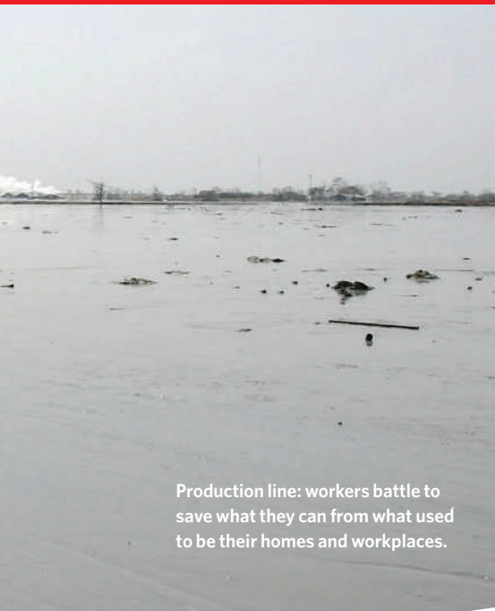
Production line: workers battle to save what they can from what used to be their homes and workplaces.