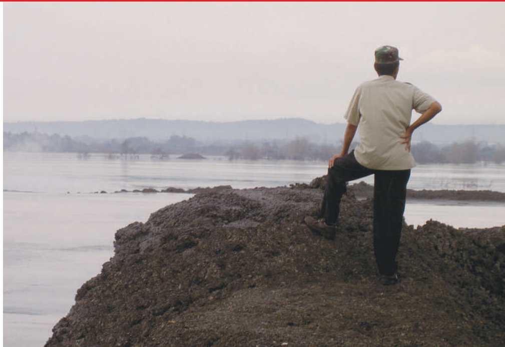
Wanderer above the sea of mud.