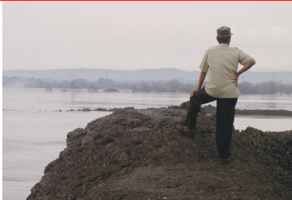
Wanderer above the sea of mud.